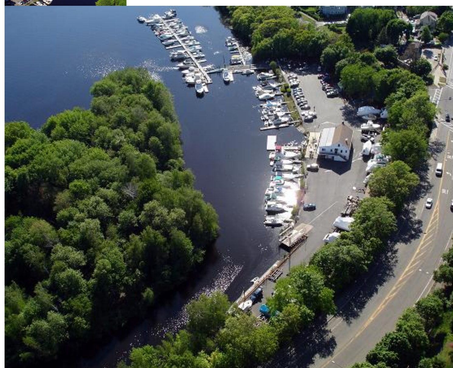
90 mesh water slips to accommodate boats from 16 to 40